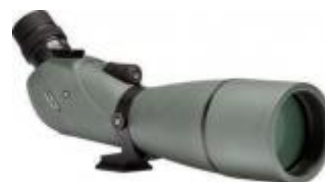
Vortex Viper 80mm + 20-60x eyepiece