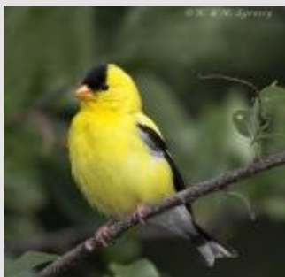
American Goldfinch

We would like to shine the spot light on one of our most popular products, our very own Unique Cardinal Feeder. 95% of its parts are made in Canada and then assembled in our store (one part is made in the USA).