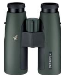
Swarovski SLC HD