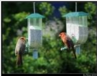
Cardinal Feeder