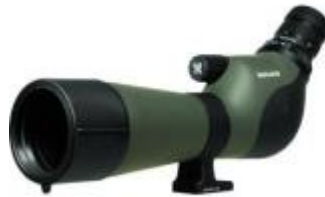
Vortex Nomad 60mm + 20-60x eyepiece

Visit us or contact us with questions and note that many models are available with limited quantities. Sale is valid until December 31st, 2013 or while supplies last.