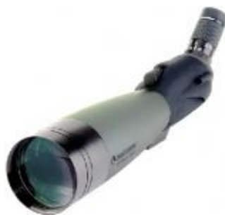
Celestron Ultima 80mm + 20-60x eyepiece

CCFA - Nature Expert will be present with a kiosk at all these birding festivals. Come and see us there.