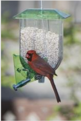
Cardinal Feeder