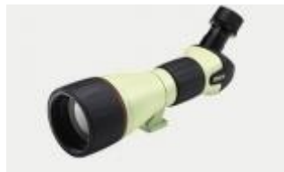
Nikon Fieldscope ED 82mm + 25-75 eyepiece