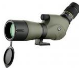
Endeavor XF 80A + 20-60x eyepiece